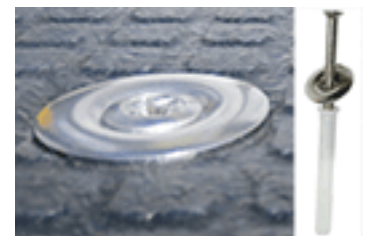
KRAIBURG fastening system: extremely sturdy, rounded off and flush with the mat