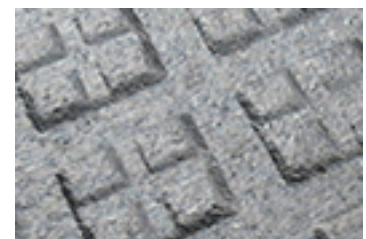
lower side: multisquare-profile