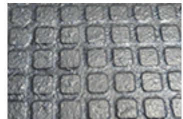
quad-surface: slip-proof and hygienic