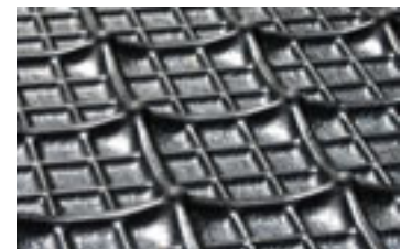
supple air cushion profile