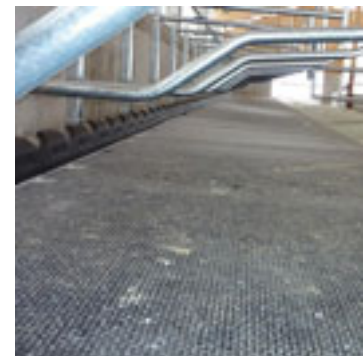
KIM LongLine in practice