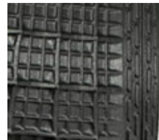
sealing lips in the rear section