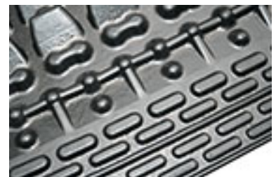
sealing lips in the rear edge minimize soiling underneath the mat