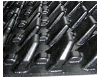
lower side profile with blades and supporting studs: stable and flexible simultaneously