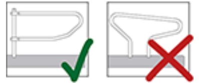
suitable for cantilever dividers only